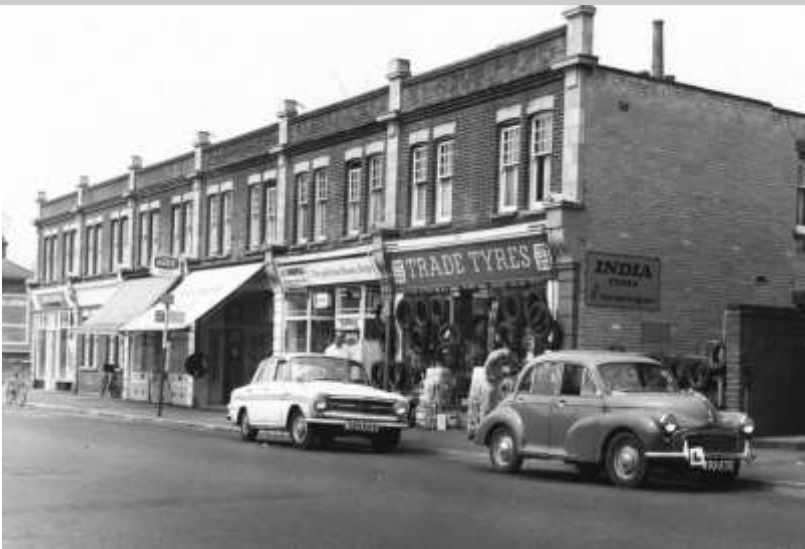
Wimborne Road, Bournemouth, 1970

Contact details: Alan Lock 01983 551014 or 07765 575458