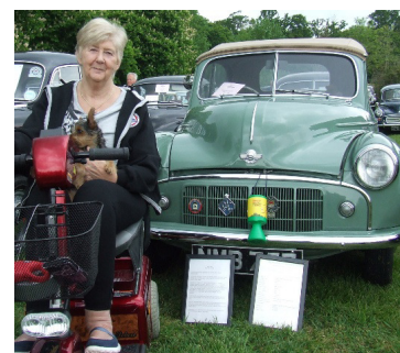
Marilyn—furthest 'trailed' car from Yorkshire