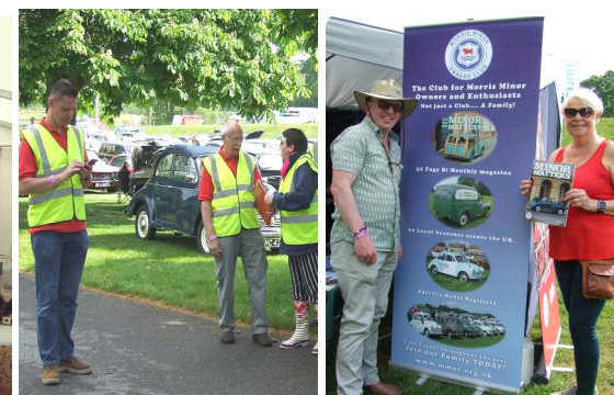
Front line team briefing . National MMOC stand