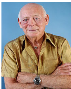
Lord 'Eddie' Montagu

Another successful Dorset Branch Morris Minor Owners Club 'Moggyfest' event, combining the National MMOC Southern Regional Rally, has just been held at the 25th Spring Autojumble event. At Beaulieu.—In 1994, 25 years ago, the late Edward Lord Montagu decided to augment the main Autumn Autojumble with an additional smaller 'Spring' Autojumble event, then called the 'Beaulieu Spring Classic' - To mark this special occasion Dorset MMOC staged a special display within the Dorset club's main marquee with a re-creation of the original Beaulieu 1994 programme title photo and also used on the 1994 colour supplement souvenir publication issued with Classic Car Magazine.